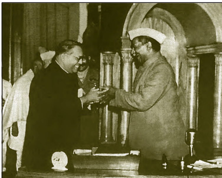
Dr Babasaheb Ambedkar presenting the draft of the Indian Constitution to Dr Rajendra Prasad, President of the Constituent Assembly