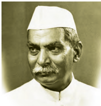
Dr Rajendra Prasad

Constituent Assembly : India became independent on August 15, 1947. Before that, the British ruled over India. They had divided India into provinces like Bombay, Bengal and Madras for the convenience of administration. The administration in these provinces was carried out by peoples' representatives. Similarly, the local princes were carrying out the administration in some areas.