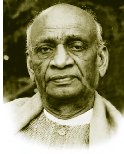
Sardar Vallabhbhai Patel