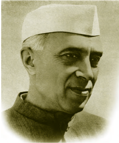
Pandit Jawaharlal Nehru

according to the provisions of the Constitution from 26 th January 1950. The Indian Republic came into existence from this day. Therefore, 26 th January is celebrated as 'Republic Day.'